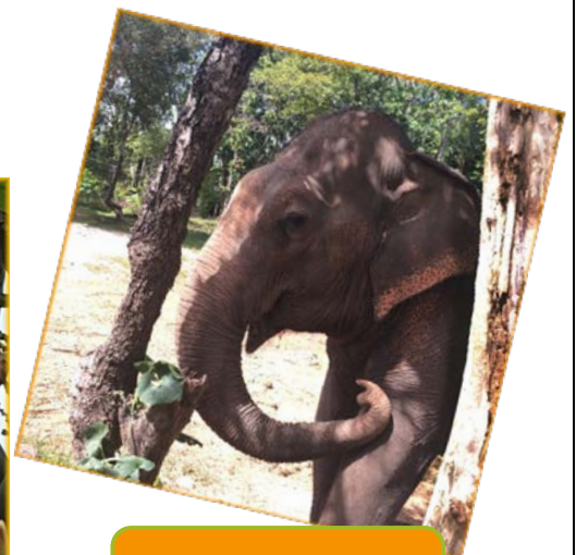
Laos National Animal - The Asian Elephant