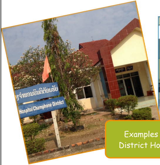
Examples of a District Hospital