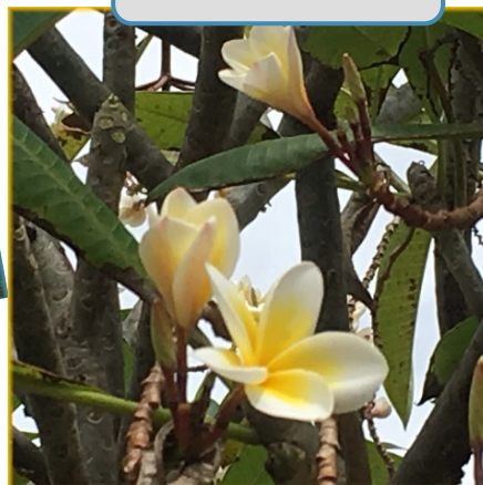
Laos National Flower - The Champa