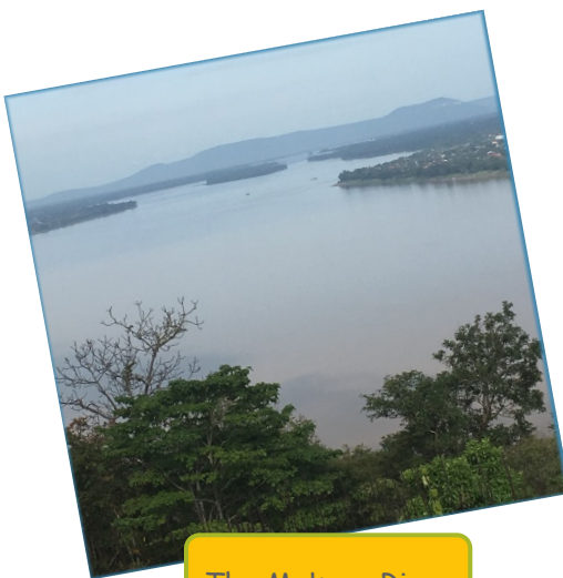
The Mekong River